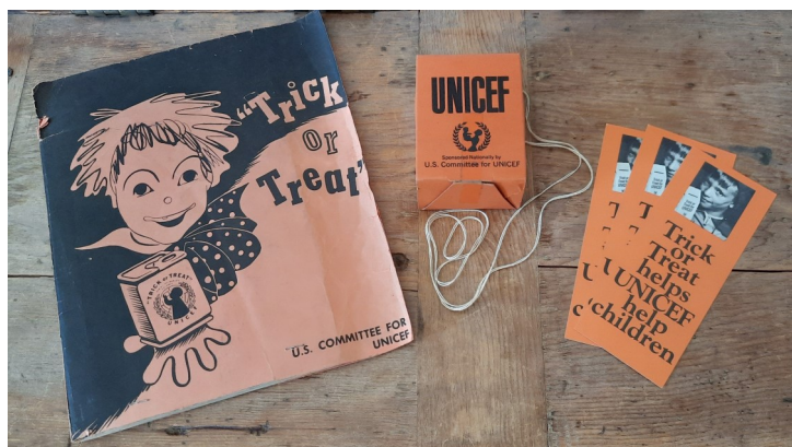
UNICEF Ephemera, HTHS Collection