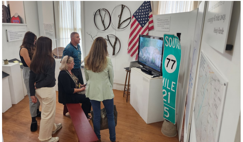
The opening reception attracted an appreciative audience.